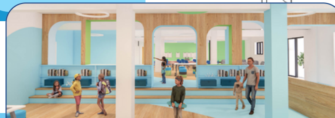
WBGC Lower Level Rendering