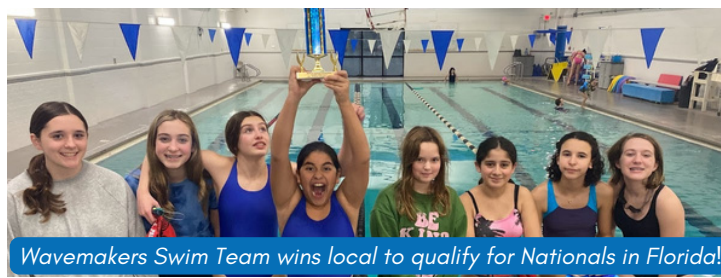
Wavemakers Swim Team wins local to qualify for Nationals in Florida!