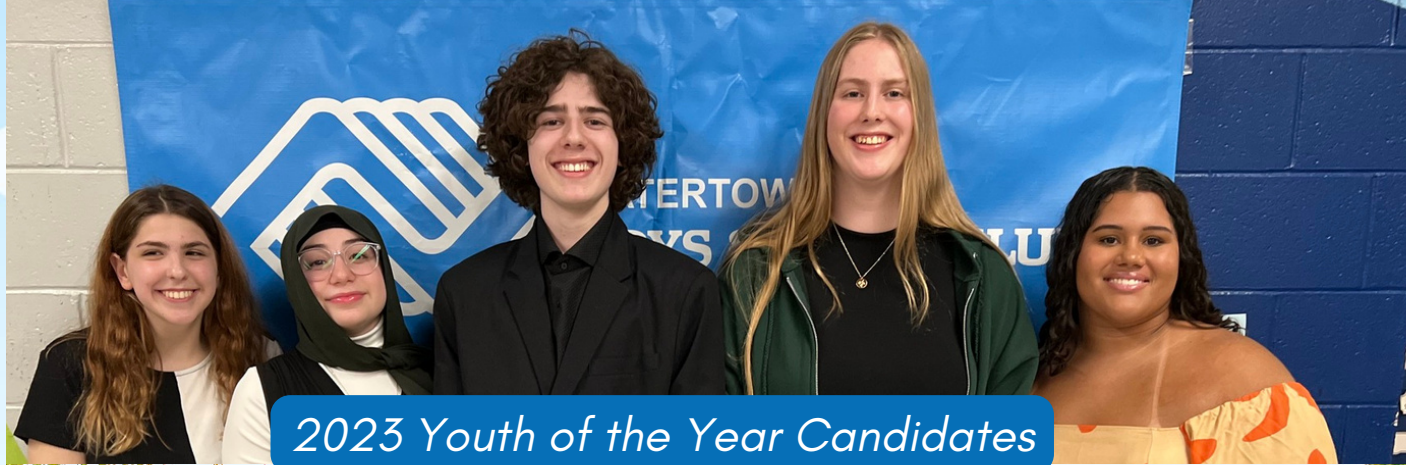
2023 Youth of the Year Candidates