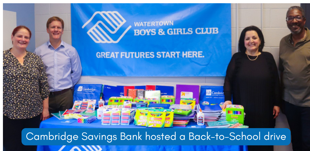
Cambridge Savings Bank hosted a Back-to-School drive