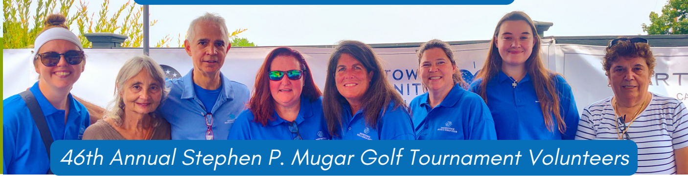
46th Annual Stephen P. Mugar Golf Tournament Volunteers