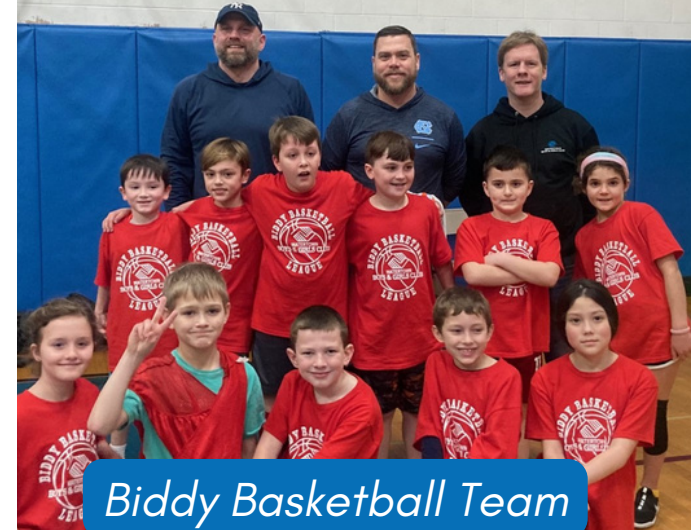
Biddy Basketball Team