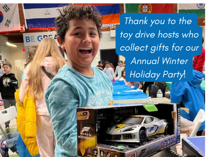
Thank you to the toy drive hosts who collect gifts for our Annual Winter Holiday Party!