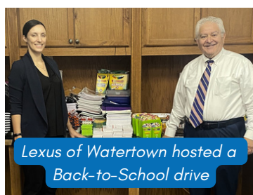
Lexus of Watertown hosted a Back-to-School drive