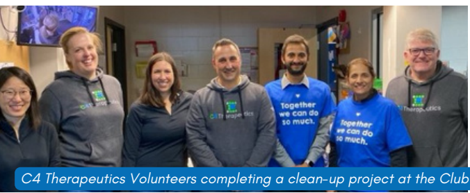
C4 Therapeutics Volunteers completing a clean-up project at the Club